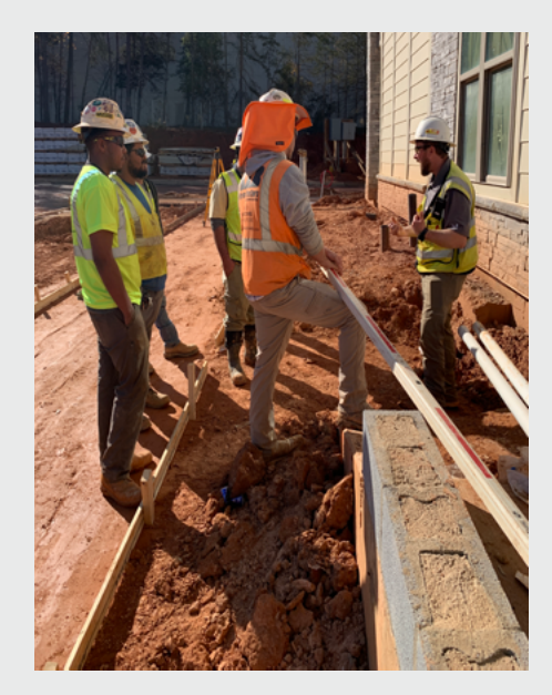
UC2 crew learning to calculate steps to match sidewalk landings prior to placing concrete